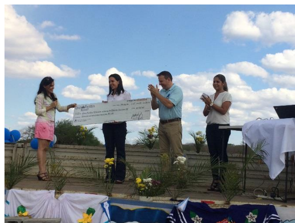
Entrega por parte de Gran Pacífica de donación de U$80,705.00 para construir clínica al Club Rotario Managua Tiscapa