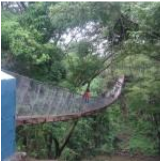
Bridge Construction Completed