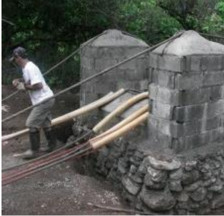
Construction of Bridge in progress