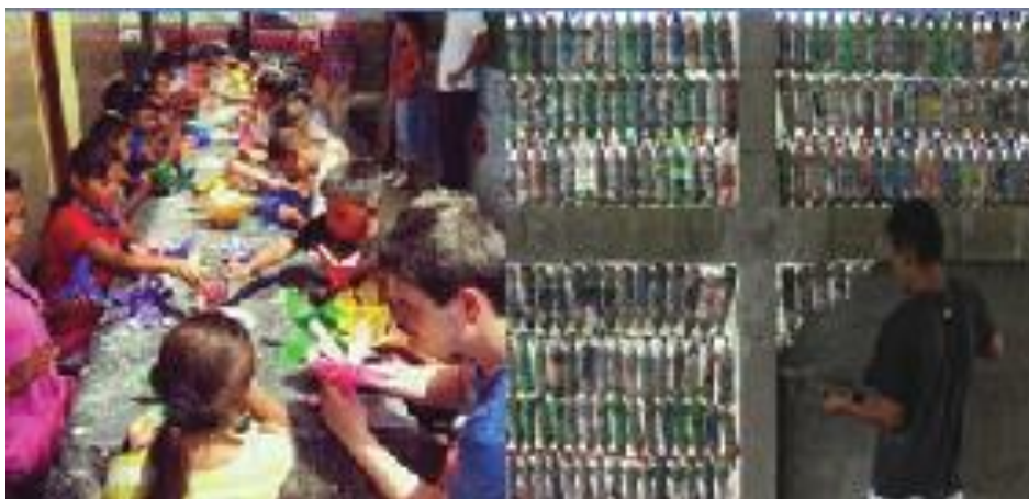
Social work at Las Banderas Community

Beauty for Ashes Project exists to release people from spiritual, physical and emotional poverty and replace their ashes for Christ’s beauty. This wonderful organization ( beautyforashesproject.org ) has recently started an art therapy program for children and recycling construction program to build new, vocational facilities.