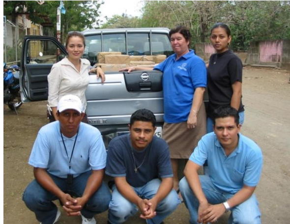
CHES Team, distribution of textbooks at schools