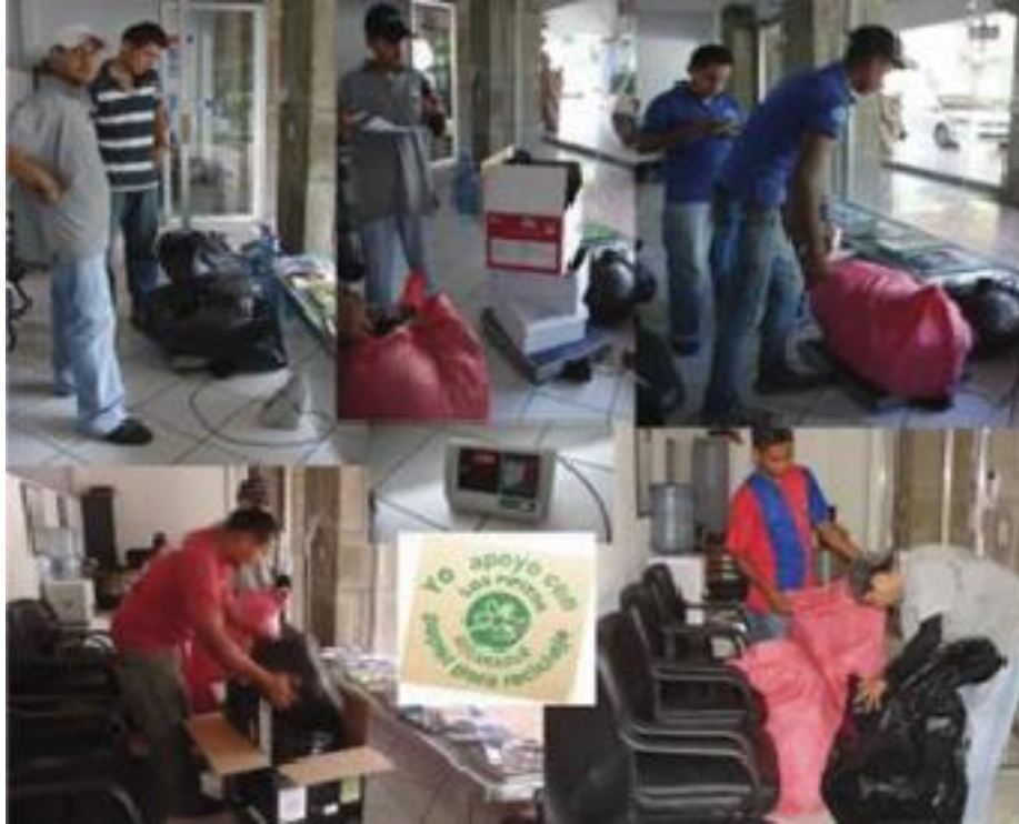
Gran Pacifica office Los Pipitos recycling program