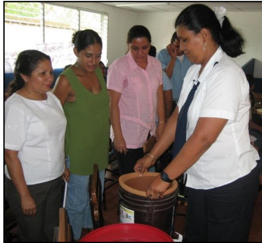
Water filters at schools

work, how to keep them working properly) the teachers and families will receive to use in schools and homes.