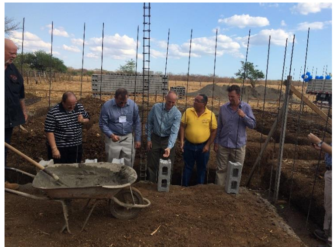
Puesta de la primera piedra de Clínica Comunitaria Gran Pacifica Resort Roberto Clemente III