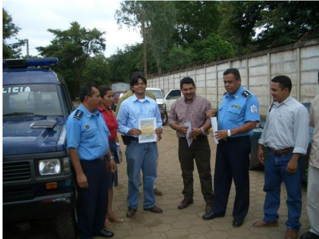
Fixed Police Vehicle, Jul. 29th, 2005

The fixing of the only Police car at Villa El Carmen was another outcome from the Rotary visit. On July 29 th , Gran Pacifica donated in parts and labor US $3,000.00 to repair the Nissan Jeep of the local police station. The car spent about 1 month in Managua and Gran Pacifica delivered the vehicle during a beautiful ceremony at the Municipality, where the key local media were invited. Since this Jeep was out of service for more than one year, it continues to present problems, but Gran Pacifica made the commitment to keep sending our mechanic to fix the vehicle.