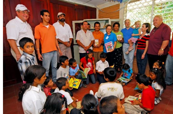
Gran Pacifica Directors with Villa El Carmen Education Ministry Delegate in Library Donation

In partnership with two key international partners, Gran Pacifica Nicaragua and Rotary International, as well as non-profit organizations already operating in the municipality of Villa El Carmen, this project builds on primary school peer-mentor programs, primary youth leadership programs, continuing training for teachers, parent-teacher associations, and health education programs in primary schools that are constantly being strengthened in the target communities. The CHES project proposes to extend and enhance these initiatives through the following nine programs: