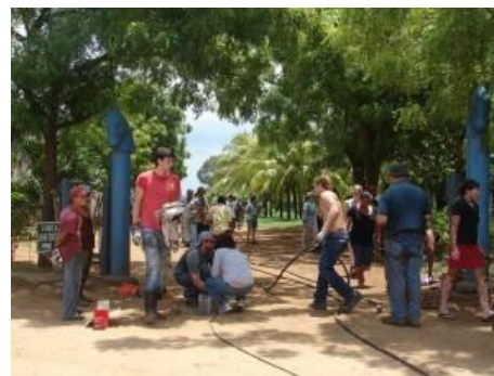
Bridge Construction in Progress