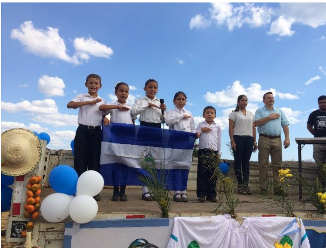
Niños de Villa El Carmen entonando el Himno Nacional en el evento de puesta de Primera Piedra de Clínica Comunitaria