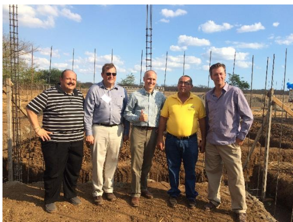
Alcalde de Villa El Carmen y Directores de Gran Pacífica en construcción de futura Clínica Comunitaria

Gran Pacífica Resort SA como parte de su programa de responsabilidad social empresarial ha decidido hacer realidad junto con otros aliados la construcción de una clínica médica comunitaria, la cual será administrada de forma privada con organizaciones especializadas. El objetivo principal de la clínica será atender necesidades de salud específicas de comunidades vecinas a Gran Pacífica Resort relacionadas a enfermedades infantiles, respiratorias, fracturas o enfermedades renales. Para este fin Gran Pacífica Resort ha unido esfuerzos con Rotary Internacional, Help Them Help Themselves (ONG Social), la comunidad local y la Alcaldía Municipal de Villa El Carmen.