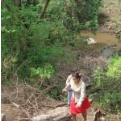
The Community urgently needed the Bridge