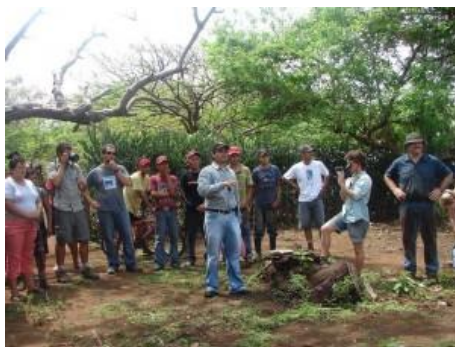
The Local San Bartolo and San Diego Community with the Notre Dame Team