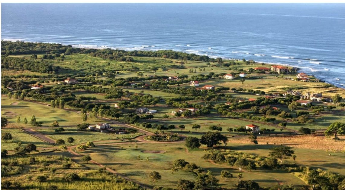
Gran Pacifica Resort – Fase I