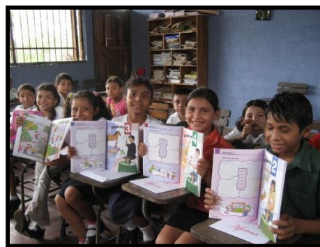
English Classes at schools

Local English teachers from Villa El Carmen schools will teach 2 hours per week to the students in 5th and 6th grade or if the school is multigrade and very small to all the students in the classroom (5 schools have only 2 or three classrooms which mean that up to four different grades are together in one classroom). 11 schools out of the 12 are not teaching English to their primary grade students.