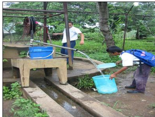
Hygiene at schools

These workshops will include topics on appropriate use of latrines, importance of washing hands, handling and keeping water clean. The project will run a total of six workshops in coordination with Institute Juan XXIII from UCA. They have worked in the area running health projects for ten years.