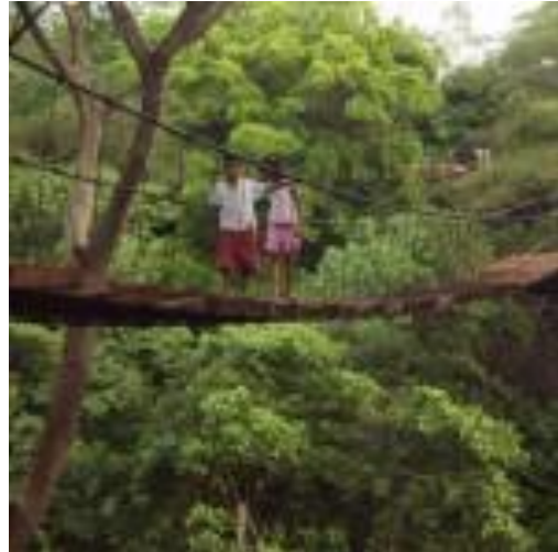
Bridge construction in progress