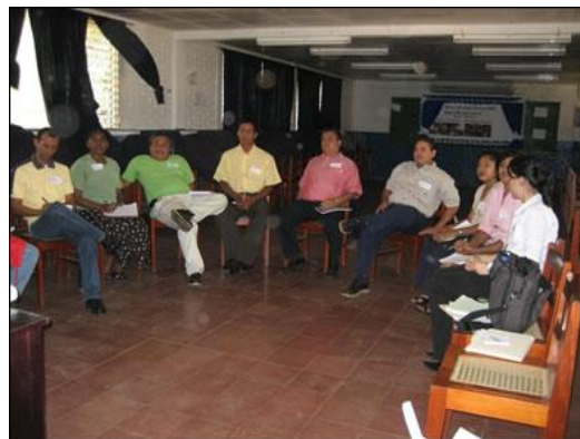
Workshops with Teachers

In addition to the workshops for teachers, working with teachers and community leaders, we will hold after-school workshops for parents and families of the students covering the critical topics of first aid, health and nutrition, hygiene, and clean water. The target populations are primary school children and their families in 12 selected primary schools in different communities throughout the municipality of Villa El Carmen, with a total target population of over 1,000 families. As an integral part of the education programs—and as an incentive for participation—families would be given ceramic water filtration devices at the completion of associated training programs.