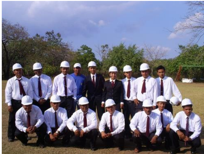
Los Cedros Construction Training Program