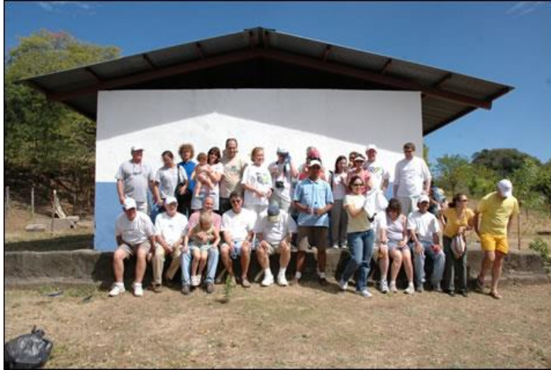
Fixing of schools

By addressing safety challenges in primary schools, we want to create a more attractive environment to entice students to remain in school. In our 12 target primary schools in communities throughout Villa El Carmen, health and safety hazards range from the absence of clean water; latrines needing repair; broken and rusted fencing around playground areas; broken and rusted playground equipment; and hazardous, jagged-edged building sidings.