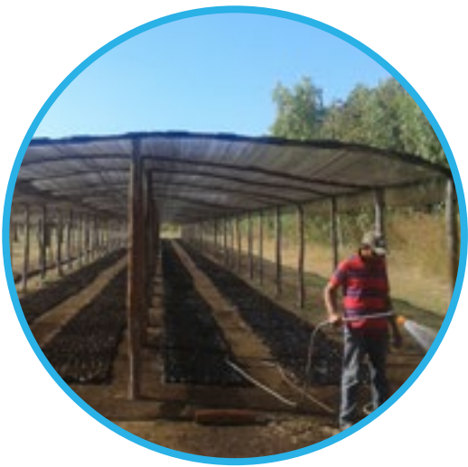
Teak Seeds Get Water During Planting

Gran Pacifica got a few (thousand) new residents this past March. Those residents are a new plantation of teak trees. The teak trees are just saplings right now, but they will soon grow to be mighty trees.