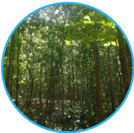
Teak Trees After a Few Years

The teak saplings are located in a nursery towards the entrance of Gran Pacifica. In fact, they can be seen when driving in on the main road to the resort. The nursery they are in now will act as temporary housing while the seedlings grow and become stronger. The nursery provides all of the necessary accommodations to ensure that the seedlings grow large and strong.