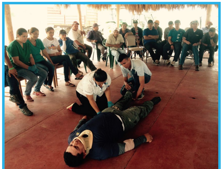
Gran Pacifica Employees Learn How to Deal with Various First Aid Situations

The courses that the employees have received over the past two years have included basic first aid care and identifying the different types of fires and fire extinguisher and their proper usage. Gran Pacifica management will be assessing the property to be mindful of the jobsite and/or work process that could cause illness or injury to employees and/or the clients. Once we feel that the basic elements of proper first aid care are understood, we can implement more in depth training on the different scenarios that can present themselves here at Gran Pacifica, and know exactly how to manage them.