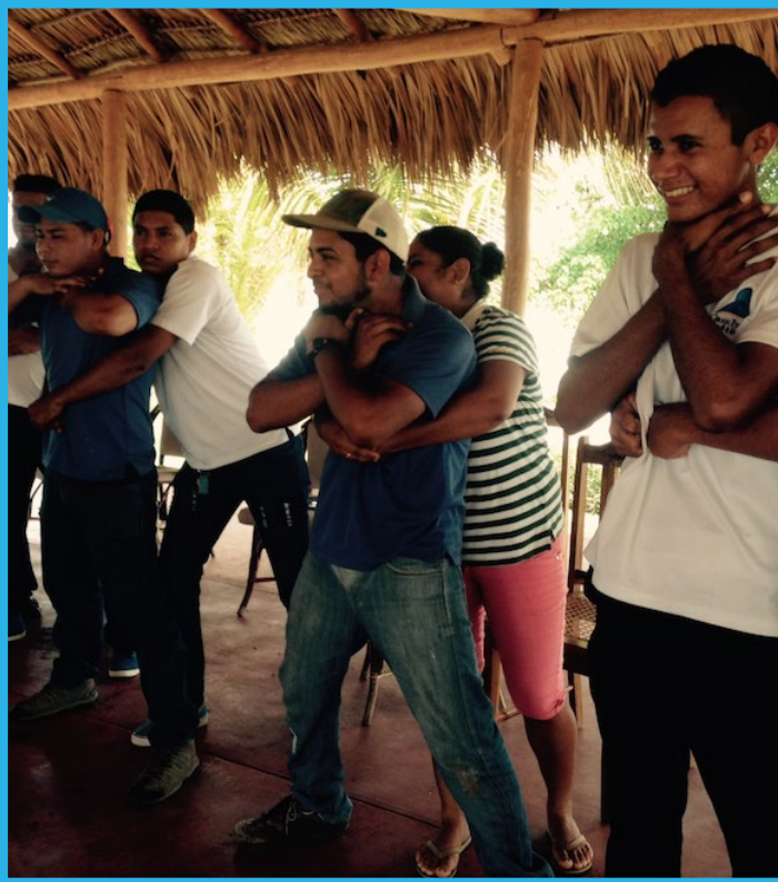
Gran Pacifica Employees Learn How to Help Someone Who is Choking

For the second year in a row, certified firefighters from Managua have come out to the property to provide first aid training courses to Gran Pacifica employees. These types of training courses will continue to be provided on a yearly basis, so that employees are properly educated on how to prevent or minimize accidents and give adequate first aid supplies and proper first aid care. The training courses are also done to foster good will among the employees by showing them the care that Gran Pacifica expends to provide a safe and healthy work environment. Many of the local Nicaraguans have never received any first aid training courses before. Gran Pacifica hopes that the training provided to them will not only serve them at the work place, but can also serve them in their own communities.