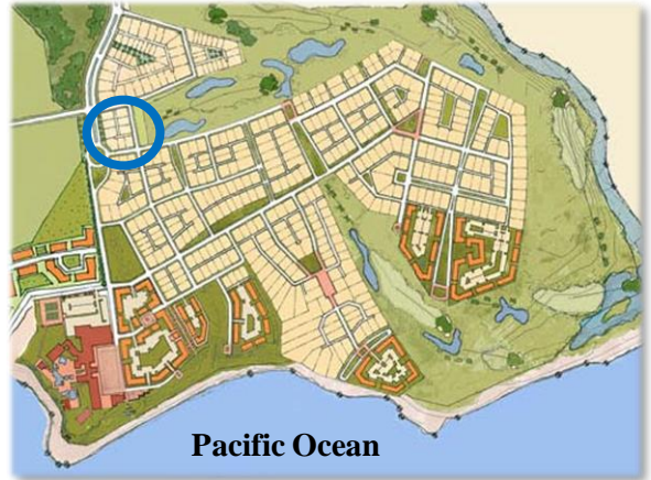
Milagro Verde at Gran Pacifica Resort

Includes: Granite countertops, ceramic tile floors, tropical hardwood handmade cabinetry, solid wood doors, stucco exterior, authentic clay tile roofs, lush landscape package.